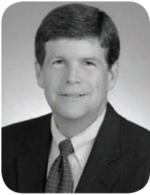
Paul J. McNulty, Esq. Partner Baker & McKenzie LLP

Paul J. McNulty joined the Washington, DC office of Baker & McKenzie LLP in 2007. He plays a key leadership role in the Firm's Business Crimes and Investigations and Corporate Compliance practices.